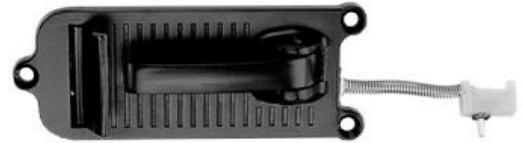
GE4-G26650B (RH, illustrated showing safety flap in 'locked' position)